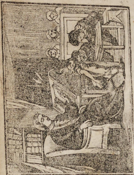
NAK-TSO-KU MU-HA-KU TSU-KU.

Hi-yv is-ti v-tsu-lät tsi-pv-nv-ku-tsin mu- ha-yi tos. Tsi-pv-nu-si hi-yv hui-hlu-sät hi- tsv-tit oh-kilh-kui-tsit hui-hli tos; mo-min tsi- hlo-fv ni-hv-kus o-mi hi-yv o-hv-po-kät nak- tso-kvn hi-tsa-ki tos; mo-mais ho-ko-lät hi- tsi-tv is-tos ko-mi ma-hi-kot i-tvn v-fun-nä-tit